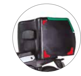
Cargo box 200L